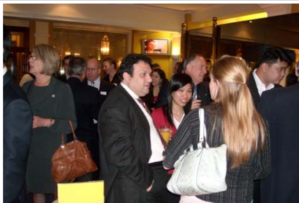
Rotary Means Business - August 2008

Please send us your news or news of your fellow members. Just email rotarymatters@people.net.au and type away!