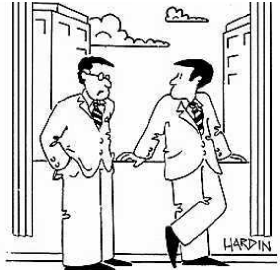
"Have you ever imagined a world with no hypothetical situations?"