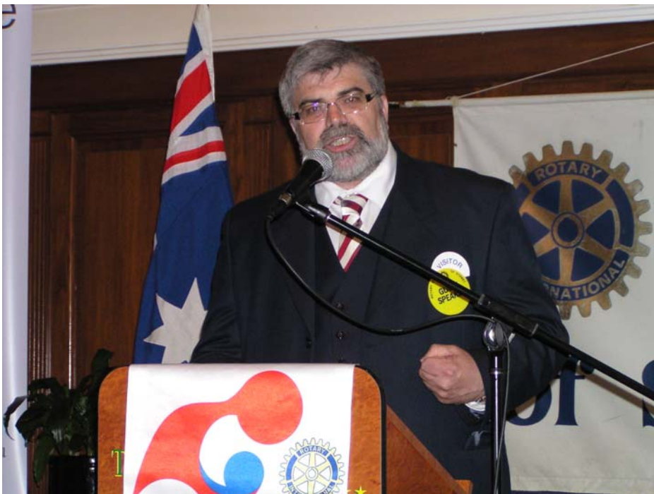
The Hon. Senator Kim Carr is pictured addressing last week's well attended luncheon.