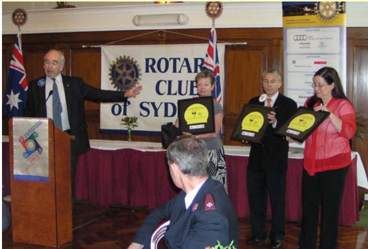
The MS MegaSwim Heroes