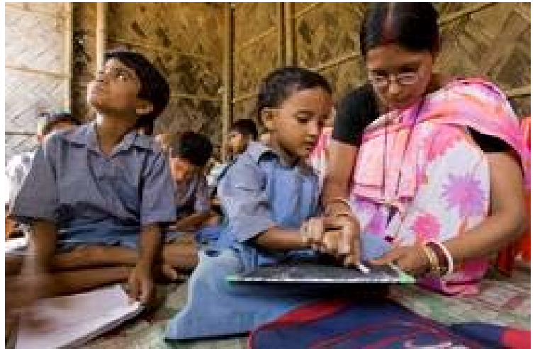
Children learn to read and write at a school in the village of Napabally, India. It's one of several villages benefiting from an integration project organised by Rotarians.